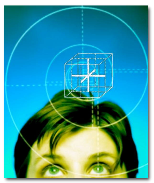
some other moral system?" "What is evil?"

Some decisions seem to be based primarily on the logic of remaining consistent with patterns of certainty – a continuum of accuracy to intuitive. Other decisions have a type of inner logic that seeks to ensure a continuum of power to powerless – the logic of power. And there is the logic of goodness – a sense of good and evil.