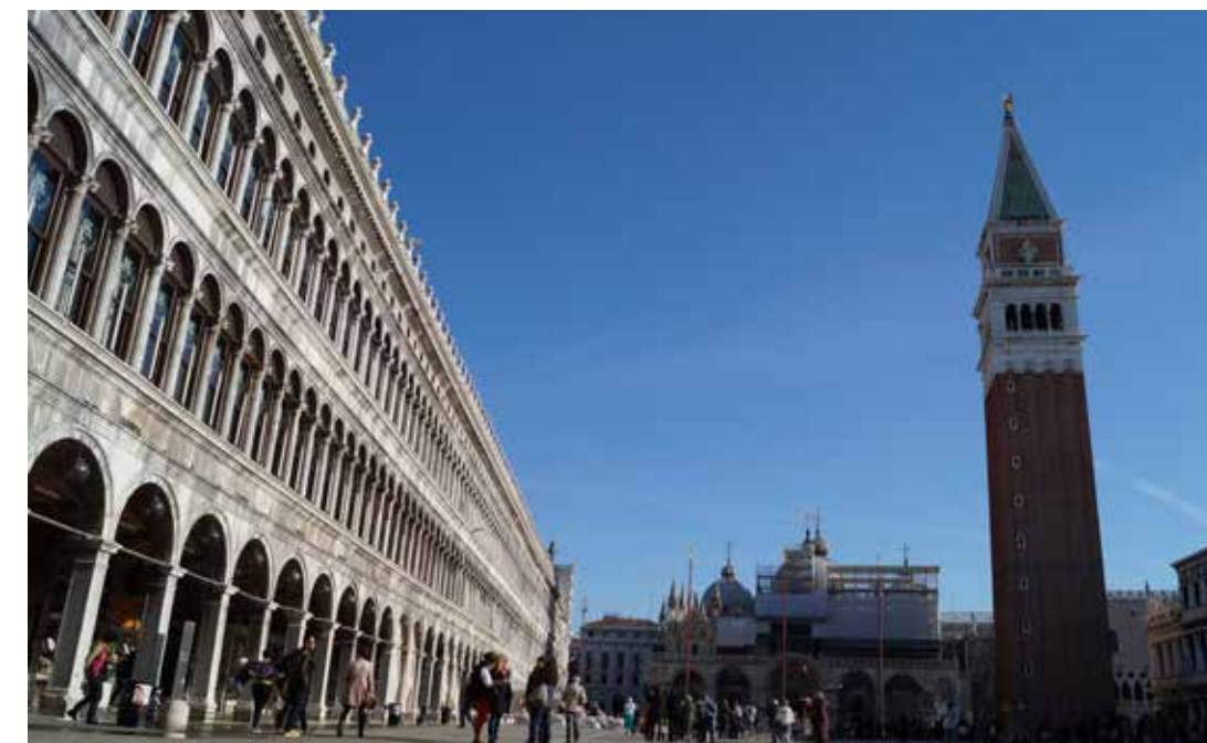
St. Mark's Square, Venice, Italy.