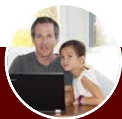
The author hard at work with his trusty assistant.