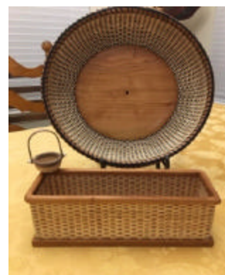
Cindy's Beautiful Ebony Tray, Trisket Tray and mini Easter Basket