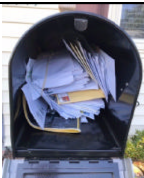
Susie's Mailbox on September 4 th !