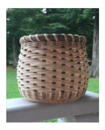
Sybill Magrill's beautiful Spiral Smoke basket woven at the September meeting.