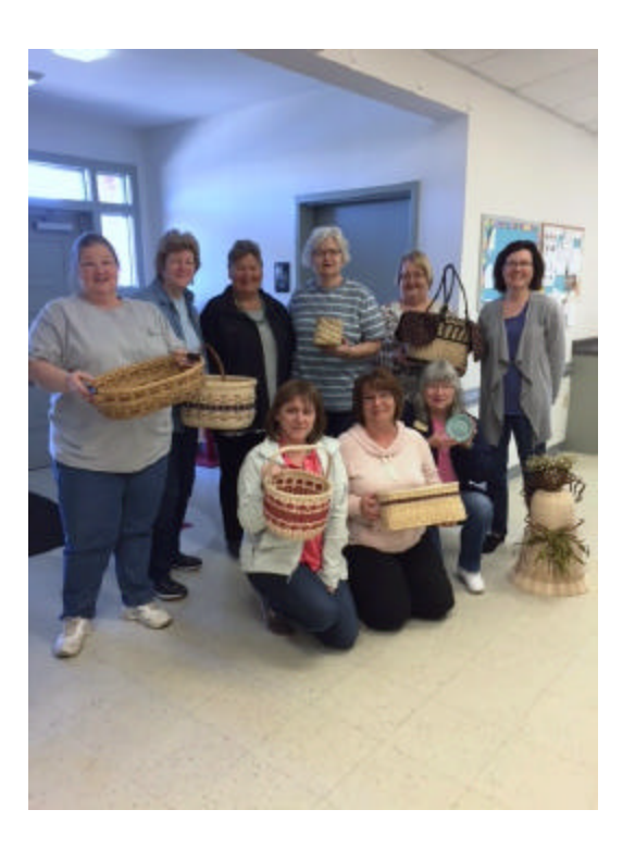
UFO's from our March Meeting! Wonderful job everyone!

Make sure it gets to her by Noon on on Sunday!