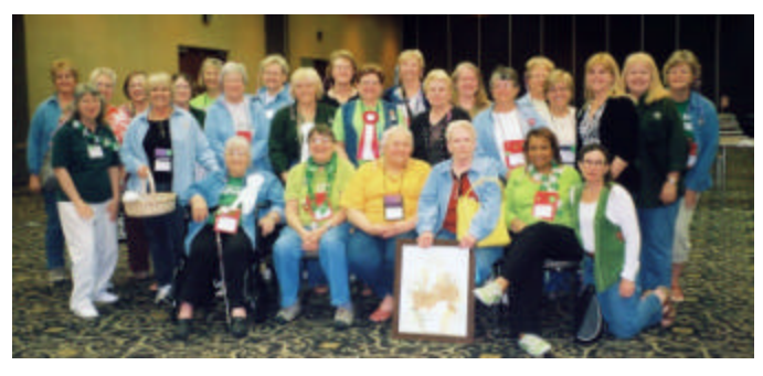
TBG members in attendance at NCBA

There were 23 vendors from which to make your many purchases, and boy did we visit them! Saturday was the Visitor Shopping Day, and 124 NCBA members came to make their purchases.