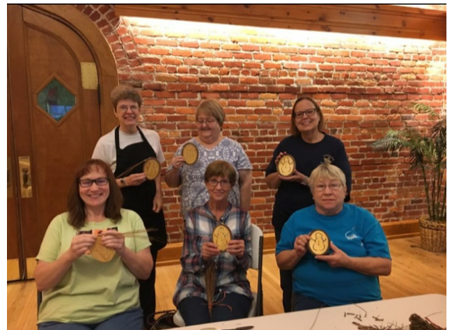
Snowman Ornament Class