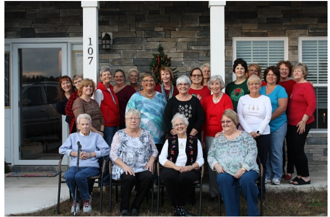
2018 Annual Christmas Party

Let me know if you want to be a part of this wonderful opportunity!!