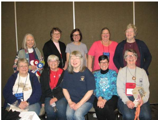
Group photo Saturday night after the business meeting