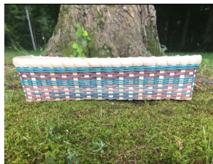
Pool Party Basket