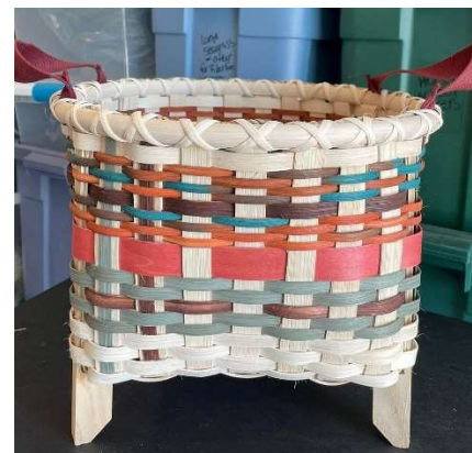
Rami's Scrap Basket