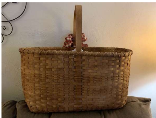
Shirley's Blanket Basket UFO