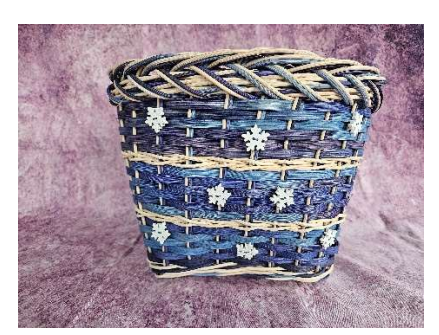
5/11 Artic Snowflake