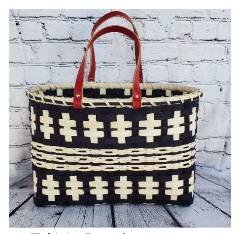
5/11 Equalizer Tote