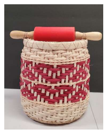
5/10 Love in the Kitchen