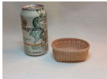
Friday 16B-Joyce Smith Shaker Teaspoon Basket Intermediate

Students will use 5/8 flat dyed reed to construct a “herringbone” twill base. The sides are woven with 1/2 flat natural doing a 2-2 twill to create this astonishing piece of work! The sides are flared as you weave to create a monstrous 20 inches across the top. Handles are 2 stakes woven then wrapped to create more stability. 14"L x 7"W x 11 1/2"H 8 hours $68