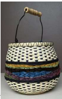
Saturday 4C-Anne Bowers Tapas Pot Intermediate

Students will learn the basics of setting up and finishing a Nantucket basket. Students will insert cane staves into the base and begin weaving with cane in and over/under pattern and change to a twill in the middle and back to the over/under pattern to finish. Basket will be woven over a metal class mold. Base and rim are cherry and caddy insert is maple. All pieces are pre-finished. Tool kit will be provided by the teacher for class use. The insert is removable. 8" wide/5" high 8 hours $95