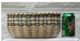
Sunday 6D-Gail Hutchinson Color Wheel Intermediate

A combination of wine dyed flat oval and natural spokes set up this racetrack base basket with a colorful pattern from the start. Attention to color placement creates lines and stripes with flat oval weavers and twists of color in Double Four-Rod Wale. A wide, dyed over 3/under 3 weaver gives the added solid stripe of color accent. Finish with round top notched handle in Double Strand Braid technique. Several color choices available. 8"L x 6"W x 5 1/2"H (10" w/handle) 4 hours $68