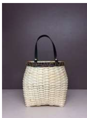
Sunday 4D-Anne Bowers Baby Bump All levels

Students will learn the basics of setting up and finishing a Nantucket basket. Students will insert cane staves into the base and begin weaving with cane in a twill pattern. Basket is woven over a plastic mold for class use. A cheater rim will be used to finish the basket and the handle will be attached with bone knobs. The base, rim, handle and shovel are oak and will be pre-finished. A tool kit will be provided for class use. 5 1/4" high and 5 1/2" wide 6 hours $85