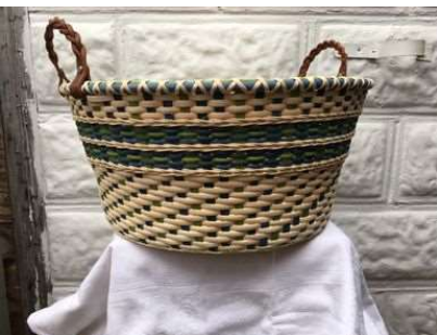
Friday 6B-Gail Hutchinson Baby Bushel Intermediate

A 5" traditional woven base, and four dyed colors, starts this basket, next in my series of "Cats". Natural flat oval weavers; then coral, aqua, neon green and navy triple rows of Double Four Rod Wale create this carefree design. Several other color choices available. Emphasis on hand and finger placement with shaping hints for a great 9" diameter cathead shape, attention to dyed reed combinations and color placement. The "instructor-made" teardrop handle is covered in a new round reed wrap. 5"L/5"W/6 1/2"H (12" w/handle) 9" diameter 6 hours $72