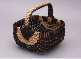
Friday 4B-Anne Bowers Triple Braided Margaret's Square Intermediate

Students will learn the basics of setting up and finishing a Nantucket basket. Basket is woven over a plastic mold, which is for class use only. Students will insert cane staves into the base and begin weaving a twill with cane weavers. The maple base and slip-on rim are pre-finished. Students will add the head and embellish with wings and halo. Tool kit will be provided by the teacher. 5"wide/13" high 8 hours $90