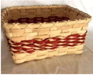
Sunday 15D-Elaine Sinclair Pretty Storage All levels

Students will learn how to “fill” a bottom and do chicken feet. Beautiful curls will add to this pretty storage basket. 10 1/2"L x 7 1/2"W x 7"H 4 hours $45