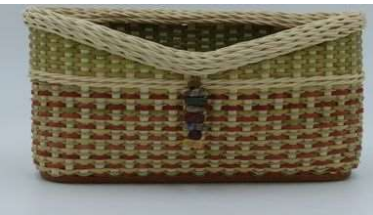
Friday 9B-Annetta Kraayeveld Balance Intermediate/Advanced

You will receive a reusable mold made from PVC and will coil a cylinder using glycerin treated pine needles and waxed linen thread. Heat colored copper foil is used as an overlay design element. Once the cylinder is complete, Jim Koon will attach the hand turned red oak lamp base and lid, then wire the lamp. Materials include hand turned red oak base and lid, all the lamp parts including wire and plug, heat colored copper foil strips that compliment the red oak; glycerin treated pine needles, 4 cord waxed linen, #2 darning needle and 1/4" ferrule. No special tools needed, but a good pair of scissors to close cut waxed linen is a good idea. 4" diameter 6-8" high without the shade or lid 8 hours $110