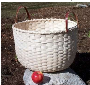
Friday 10B-Karen Maugans Hilltop Chore All levels

Elegant and useful!! The focus of this class is controlling shape while working with fine materials. Techniques include chase weaving, four-rod wale and decrease rows. The final emphasis of the class will be the Gretchen border. Students will concentrate on understanding the technique while creating a smooth and seamless rim. 10"L x 4"W x 5"H 8 hours $85