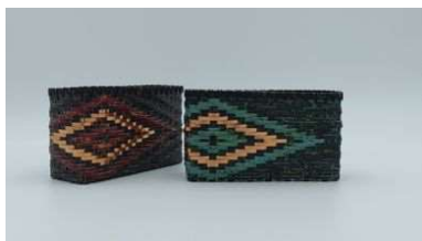
Sunday 9D-Annetta Kraayeveld Peripheral Intermediate

You will receive a jasper cabochon already attached to bead backing and ultra suede. Using waxed linen thread, you will coil one time around the cabochon. The braided leather necklace is attached to the cabochon with a few whip stitches and then sized to your neck. No special tools needed except a pair of scissors that will cut waxed linen. 2 1/2"L x 2 1/2"W x 2 1/2"H 4 hours $25