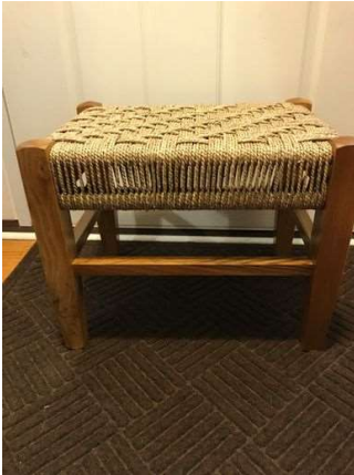
Saturday 1B- Greg Barco Seagrass Footstool All levels

Japanese diamond weave. Extra spokes will be added as the basket is woven and the rim is triple lashed with cord. There is a choice of terracotta or royal blue for the basket and a variety of cotton cord for accent color. SPOKE WEIGHTS A MUST. BRING TWO IF YOU HAVE THEM. 15"W x 2"H 8 hours $75