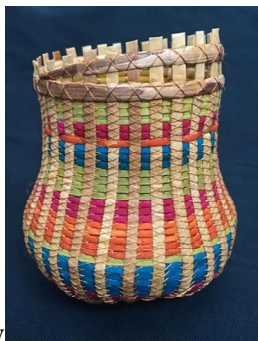
Friday 17B-Polly Adams Sutton Cedar in Many Colors Advanced

This is a Shaker fancy basket woven with Black Ash over a class mold. The basket is a smaller version of the Spoon Basket. Good practice for weaving with smaller ash splint. Weaving techniques include chase weaving, making rims for a smaller basket and putting the rims on a smaller basket. Students will need small sharp scissors, small packing tool and small clips. 3 5/8"L x 2 3/4"W x 1 7/16" w/o handle 8 hours $85