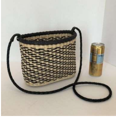
Saturday 21C-Pam Wilson Stormy Weather Advanced

part The White's Coastal Collection. The mold is for class use only. Students will need a small water container, scissors, knife and small packing tool. 12 1/2"H x 8"W x 5"H 8 hours $110