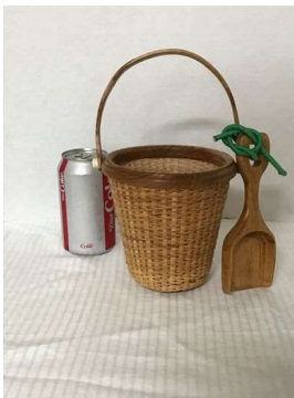
Sunday 3D-Jan Beyma Nantucket Sand Pail Intermediate

This fabulous purse begins on a flat back/race-track style slotted base type in oak. It features reed spokes with Hamburg cane and round reed weavers. The basket is woven in three rod-wale and the Japanese wave weave with emphasis on proper shaping. It is finished off with a long braided leather shoulder strap. The base will be sanded and rubbed with polyurethane prior to class. 9"L x 5 1/2"W x 8 1/2"H 8 hours $95