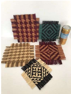
Thursday 21A-Pam Wilson Demystifying Twills Advanced beginner and up

Cherry base, rim and specialty divider handle. Woven in the traditional Nantucket way with cane. This basket will hold 4 mini mason jars. Basket will be pre-started for students. Mold is for class use only. Students will need a small water container, scissors, knife and a small packing tool. 5"L x 4 1/2"W x 7"H 4 hours $55