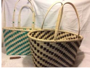
Friday 15B-Elaine Sinclair Monster Tote Intermediate

Students will start with a wood base with the spokes pre-glued prior to class. The design is woven with three colors of cotton cord and suede leather accent between the different patterns. The inspiration of this basket was to teach students how the set up creates the different patterns. The rim is a regular reed rim with cotton cord filler and lasher. Students will have a choice of colors. Techniques include triple twining, completing a row and setting up for the next, spiral and stack pattern, and shaping. Regular basket weaving tools. 4 3/4" diameter x 3 1/4" high 8 hours $79