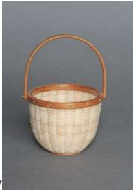
Thursday 18A-Eric Taylor #3 Round Swing Intermediate

New this year is the beginning of The Cottage Round set. This is the three inch size. Mold is woven with brown ash uprights and weavers. It is finished with a cherry swing handle and rims. 3 1/2" diameter x 5" high 4 hours $90