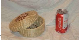
Friday 11 B-Barbara McCormick Round Sweetgrass Sewing Basket w/lid All levels

Miss Jimmie Kent designed this basket and has very joyfully given me permission to teach it. The basket is very plain and simple, yet very attractive. Start with an 11" grooved base, start/stop weaving, double lashing with leather handles. 11"W x 16"H 8 hours $70