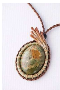
Sunday 8D-Jean Koon Pine Needle & Cabochon Pendant All Levels

This tiny basket is woven from sweet grass, 3mm reed and dyed ash. The necklace is waxed cord with optional beads and sliders to adjust the length. Students need small micro clips, small tapestry needle, small awl and a packer. No water. 1"L x 1"W x 1"H 4 hours $45