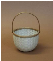
Sunday 18D-Eric Taylor Cottage #4 Round Swing Intermediate

Using sweetgrass for the spokes, this little necklace will be triple twined with the NW sweetgrass in a chase twining pattern. A knotted cord will finish the piece. Tools needed: squirt bottle, towel, tapestry needle, basket shears and packing tool. 1"W x 1 1/2" H 6 hours $85