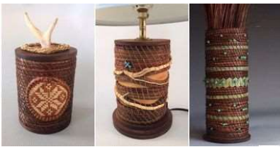
Friday 8B-Jean Koon Light Up Your Life All levels

This basket is woven from flat fiber splint, a paper based product. The base is square and the sides are a continuous weave. Shaping is stressed, no mold is used. Normal basket tools, but NO water. 6"- 10"L x 6" - 10"W x 8"H 6 hours $48