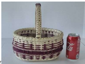
Sunday 5D-Pati English Wine Lines Intermediate

This fun little basket is a great one to hang on a doorknob or the wall. It features a "baby bump" in the front, a flat back and is topped off with a very interesting rim application and a leather handle. Students will choose their rim colors. Lots of techniques to learn!! 7-8" high not including handle 6 hours $48