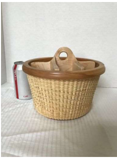
Saturday 3C-Jan Beyma Nantucket Picnic Caddy Intermediate

This is our traditional seagrass footstool. No special tools needed. Teacher will provide all tools. Students will have the option of choosing either a 15" frame or a 24" frame, indicated on registration form. 8 Hours 15" $70 24" $90