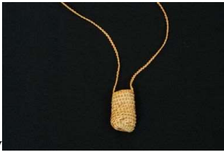
Sunday 17D-Polly Adams Sutton Chase Twine Sweetgrass Necklace Beginner/Intermediate

Students will learn how to “fill” a bottom and do chicken feet. Beautiful curls will add to this pretty storage basket. 10 1/2"L x 7 1/2"W x 7"H 4 hours $45