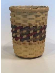
Thursday 19A-Jamie Van Oekel Randing Round Up Beginner

New this year is the beginning of The Cottage Round set. This is the three inch size. Mold is woven with brown ash uprights and weavers. It is finished with a cherry swing handle and rims. 3 1/2" diameter x 5" high 4 hours $90