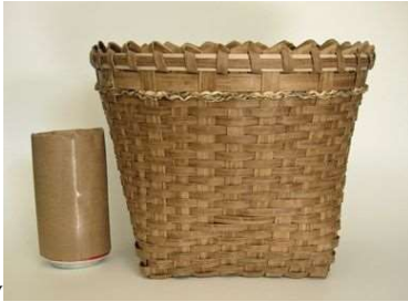
Friday 7B-Carolyn Kemp Fancy Flared Fiber Splint Basket Intermediate

and when to add handles. Amish made leather handles finish this reed basket. 18"L x 18"W x 8 1/2"H 8 hours $96