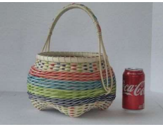
Friday 5B-Patti English Colorful Cathead Intermediate

This square ribbed basket will help you to overcome any fear of creating ribbed baskets. Starting with a triple cane braided handle, students will then learn Anne's easy method of making a God's eye, then show students how to insert their pre-shaped ribs. Weaving begins with cane and proceeds to dyed reed. Color choices. Please bring a sharpened knife to class. 8" wide/8" high 8 hours $65