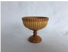
Sunday 20D-Charlene and Bill White Small Nantucket Pedestal All levels

Start or continue building The Cottage Round Swing Set. This is the four inch size. Mold woven with hand pounded Brown Ash uprights and weavers. This basket is finished with a cherry handle and rims 6 1/2" H x 4" Diameter 6 hours $120