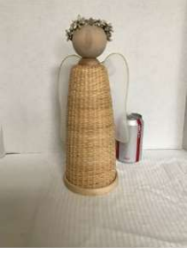
Friday 3B-Jan Beyma Nantucket Guardian Angel Intermediate level

Students will learn the basics of setting up and finishing a Nantucket basket. Basket is woven over a plastic mold, which is for class use only. Students will insert cane staves into the base and begin weaving a twill with cane weavers. The maple base and slip-on rim are pre-finished. Students will add the head and embellish with wings and halo. Tool kit will be provided by the teacher. 5"wide/13" high 8 hours $90