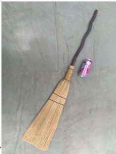
Friday 12B-Mary Normand Sweeping Broom Intermediate

Experience the creation of two sweetgrass baskets united as one with a base and lid. Sweetgrass baskets are coiled with sweetgrass and southern long leaf pine needles and lashed with strips of palmetto. Techniques taught will enable the students to design a variety of shapes and sizes of sweetgrass baskets. Students will need scissors only. No water required and additional tools will be provided during class. size varies 8 hours $95