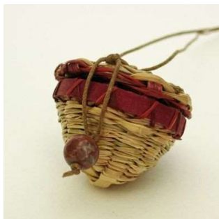
Sunday 7D-Carolyn Kemp Mini Sweetgrass Acorn Necklace Basket Intermediate

This basket is woven on a wooden slotted base with beautiful space dyed reed. Learn four rod-wale with a step up, Japanese twill and wheels. Braid a rim to finish this basket. 11"L x 9"W x 5 1/2"H 6 hours $63