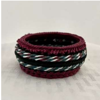
E3 8am-5pm Magenta Meadow Linda Scherz

Designed with the waxed linen lover in mind. Twine the base and then use the spokes to create a foot. A combination of twining, triple twining, and quad twining create the pattern with texture. Linda's unique braided rim is a nice finish to this technique packed basket. Students will learn the importance of numbers in making all the techniques work. There will be concentration on shaping while weaving.