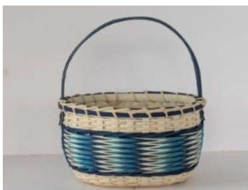
S1 6pm-10pm Bargello Arrows All Around Pati English

Start this colorful little basket with a 4"x6" racetrack base and Three-Rod Wale to secure spokes. Over/Under, Start/Stop Weave, Double Three-Rod Wale in dyed reed creates a border for the continuous Bargello Arrows including Three-Rod Wale with Reverse Three-Rod Wale in royal and aqua (other color choices). Finish with Cable Stitch Lashing and dyed Overlay, dyed Rim Filler, and a fine leather Handle sewn near the rim with waxed linen.