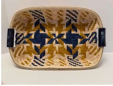
D3 8am-5pm Dueling Diamonds Peggy Adelman

This basket is woven as a twill. The base used 1/4 flat dyed and natural reed. The order the stakes are laid out and woven in create the interesting diamond pattern. The sides are woven in an over 2, under 2 twill. There are ceramic handles set onto the rim. It is unlikely you will get to setting your rim on in class. **A spoke weight is necessary for this class. 14" x 9" x 3", Intermediate, 8 hrs. $70