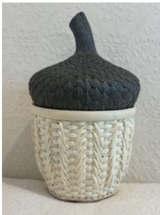
C3 8am-5pm Elegant Acorn Kathy Patronzio

This elegant acorn basket is woven over a solid mold. The basket is woven with Hamburg cane. The intricate wave design is woven in as you weave. Finished off with the stem topper.