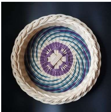
K3 8am-5pm Zennie Susan Baxter

Zennie is all about the strength and versatility of round reed. It starts with an overlaid double cross base worked off of a jig so that the weaver spends time weaving and not chasing spokes. The base uses color, spoke count and a design element called "becoming" to create an irresistible base. The sides use 4-rod wale to increase platter strength and a turquoise accent band to liven things up. The wrapped core border utilizes double spokes and finishes off this hard-working platter. "This baby is so strong it just may be considered a weapon." Bent-nose pliers and jigs will be available for class use and jigs may be purchased during Marketplace. Discussion, demonstration and lots of pictures will give slower weavers the tools required to finish the project at their leisure.