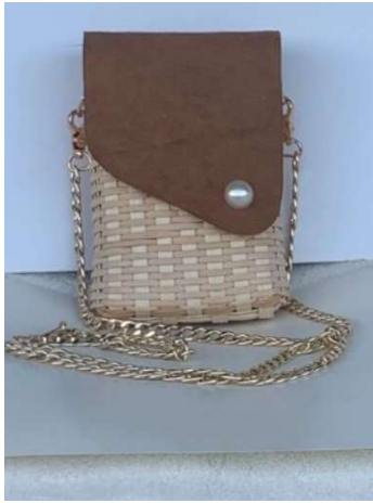
R1 6pm-10pm Classy Lady Purse Jenny Elzy

This cross-body purse is woven on a mold with 11/64 f/o. This beautiful suede leather flap is embellished with a faux pearl and has a magnetic closure. It is large enough to accommodate the new larger phones plus incidentals like a checkbook, keys and/or wallet. It has a foam lining to prevent damage to cellphones. Students will have a choice of light or dark. Choice of strap included. Pre-started, mold for class use only, no kits available.