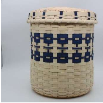
J3 8am-5pm Bonnet Basket Judy Wobbleton

This traditional design was used originally to store your Sunday bonnet. Today it is the perfect place to store your treasured item(s). This basket begins with a slotted wooden round base. Woven with reed, techniques include chase weaving, traditional over under weave with overlays. Emphasis will be on maintaining the round shape then creating a lid to fit.