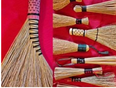
B3 8am-5pm Bunch of Brushes (AM) and Turkey Wing Broom (PM) Mary Normand

Bunch of Brushes -the brushes in this class will teach basic broom making techniques and have a variety of uses. Some have simple binding and top treatment while others have broomcorn stems applied and woven to make a decorative handle area or a ribbon woven into the binding to add a little color. They can be used as clothes brushes, cake testers, and scrub brushes (especially useful for cast iron pots). Students will be able to make as many as they wish in the 4-hour class.