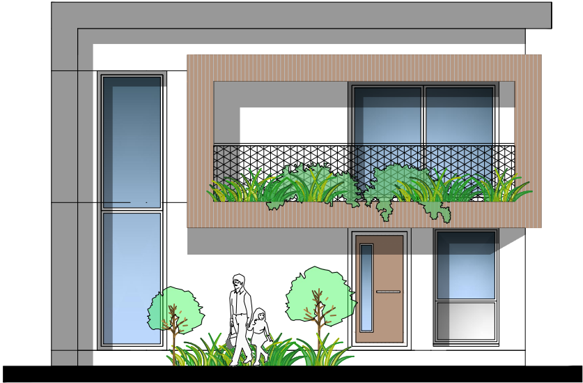
PROPOSED FRONT ELEVATION. 1:100