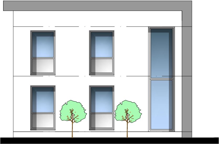
PROPOSED REAR ELEVATION. 1:100