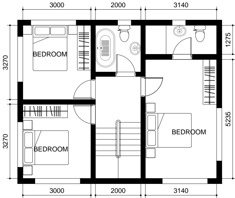
PROPOSED FIRST FLOOR PLAN. 1:100