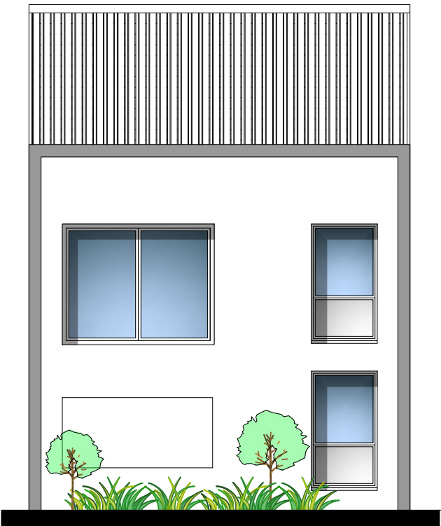
PROPOSED RIGHT ELEVATION. 1:100