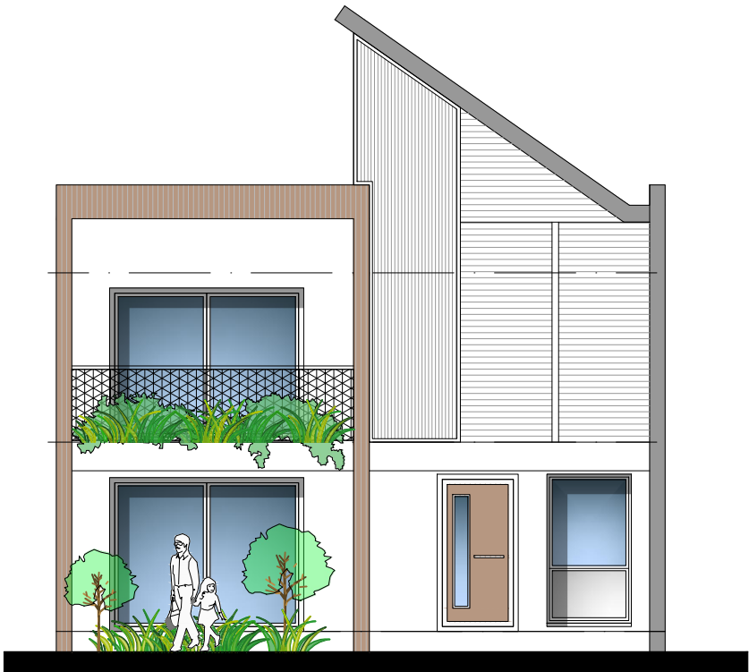
PROPOSED FRONT ELEVATION. 1:100