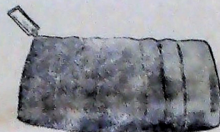
Bags of plastic patent or smooth leather $4.98 to $8.98