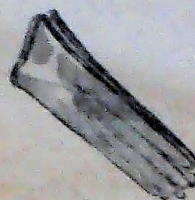
Genuine Pigtex Gloves $3.49

CHOOSE YOUR ACCESSORIES WITH CARE — It's the finishing touches that determines your appear- ance.