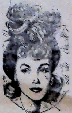
New hat fashions - with bright fea- thers of sequin trim. $2.98 to $10.98