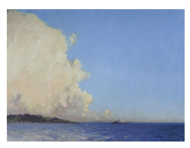
'Great West Light, Plumb Island, Tresco' by Tom Rickman. Oil on canvas 92cm x 102cm £4,500

I will be taking works from 9 of my gallery artists and I aim to curate a collection of art that stands out from the rest. With all works priced at £6,000 and under, I will be showcasing the