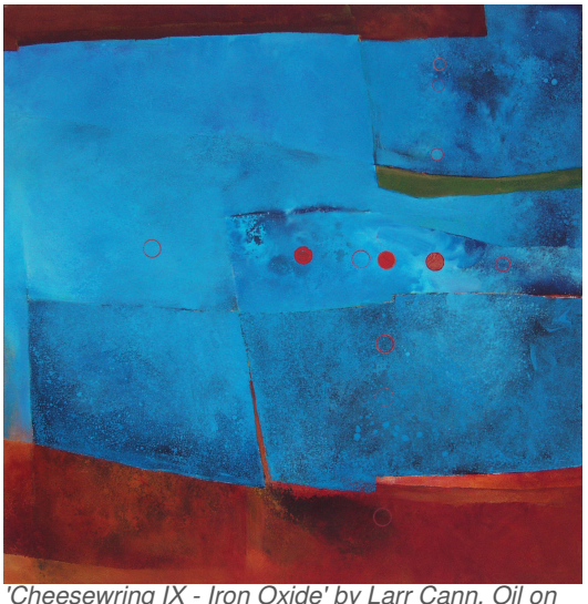
'Cheesewring IX - Iron Oxide' by Larr Cann. Oil on canvas 100cm x 100cm £3,500

Please click here to register your interest in free tickets and to learn more about the artwork on show at the fair