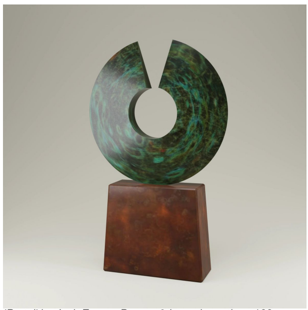
'Portal' by Jack Eagan. Bronze & bespoke patinas 100cm x

I very much look forward to seeing you there.