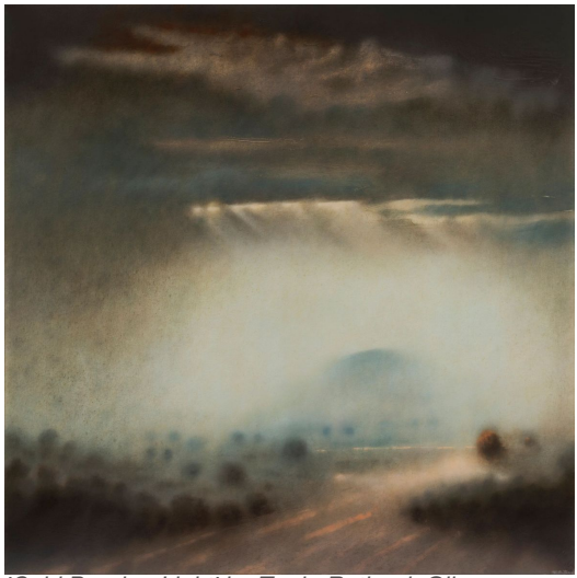
'Cold Burning Light' by Tania Rutland. Oil on canvas 100cm x 100cm £2,400