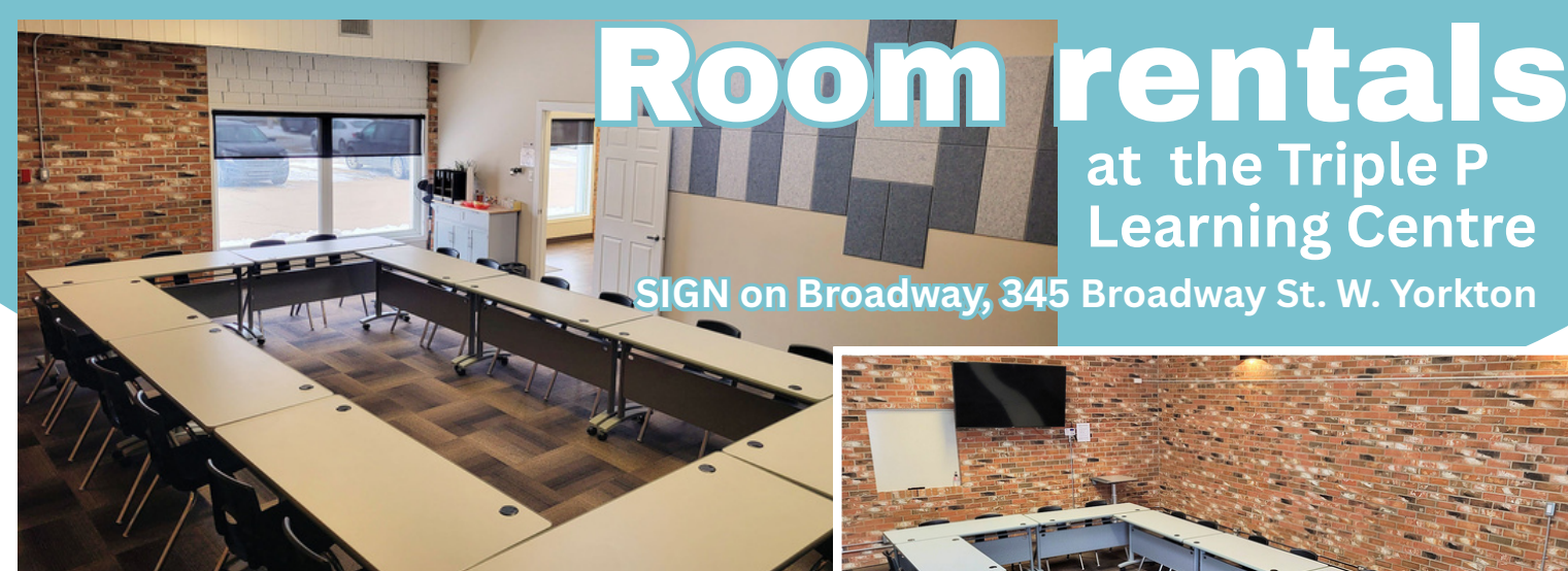
Queensland Room Capacity up to 18 Half day $105. Full day $175