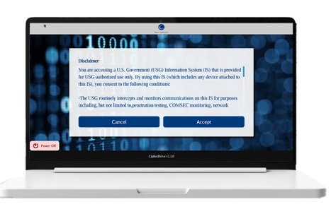
Step 2: At pre-boot, a custom discliamer can be displayed.