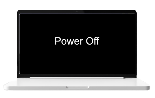
Step 1: At power off, CipherDrive-One locks the harddrive(s)