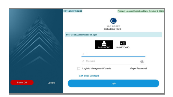
CipherDriveOne (Single Disk HWFDE)