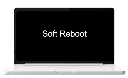
Step 4: A successful authentication will unlock the harddrive(s) and the system will soft reboot or chainboot to the operating system.