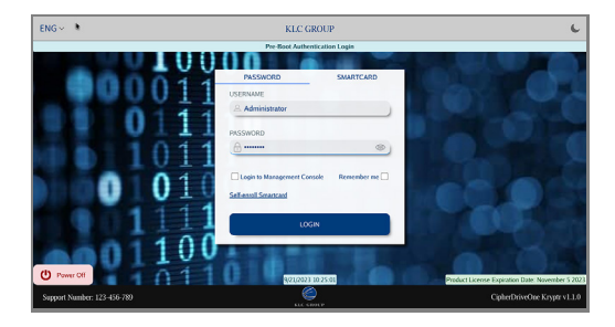
CipherDriveOne Kryptr (Single and Multi-disk SWFDE)

CipherDriveOne™ is Common Criteria certified and on the NSA's CSfC listing for meeting the Data-at-Rest Capability Package.