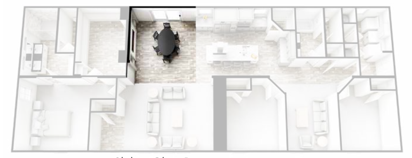
Sliding Glass Door