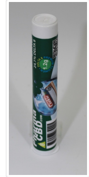
*Dry Weight %

UI Not Identified ND Not Detected N/A Not Applicable NT Not Reported LOD Limit of Detection LOQ Limit of Quantification <LOQ Detected >ULOL Above upper limit of linearity CFU/g Colony Forming Units per 1 gram TNTC Too Numerous to Count