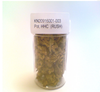
HHC Cosmic Kush 1654 A