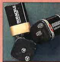
Large lantern batteries are also alkaline batteries.

The added hazardous component of alkaline batteries, mercury was eliminated in the 1990s. Since then, waste characterization studies have shown that nearly all of the old mercury alkaline batteries have already been disposed of. Nearly all of the alkaline batteries in use in Florida today have no added hazardous components. Under state law and regulations, alkaline batteries can be disposed of in the trash.