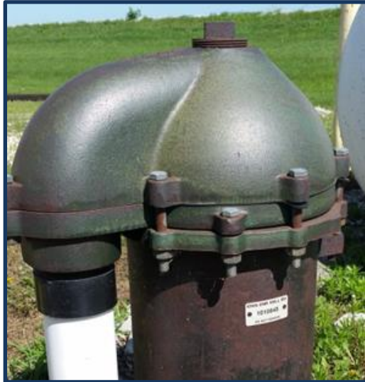
Example of a turtle back well with an access plug.

The access plug is typically on top of the well cap. Use a wrench to remove the plug in this well cap. WD-40 may help if the plug is rusted shut. If it still cannot be removed, the entire cap can be removed (see the next section). Once the plug is removed, set it in a sanitary location. The top of the hole in the cap is the measuring point. Once you are finished measuring, return the plug to the cap and tighten it.