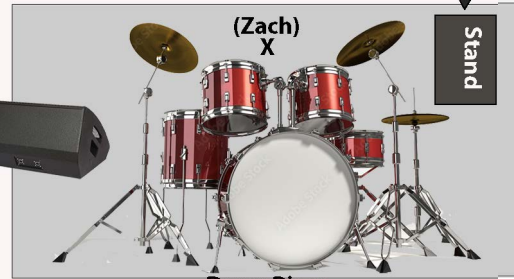
Drum Riser Mics on full drum kit

L/R XLR stereo inputs/cables into house PA for drum audio interface on stand