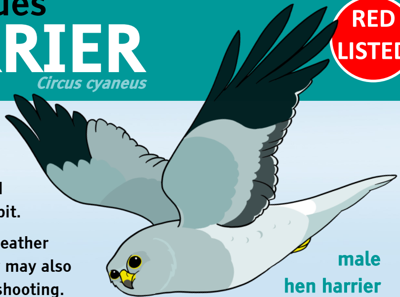
male hen harrier

Harriers like open areas including heather moorland, and it is here where they may also take red grouse, specially bred for shooting.