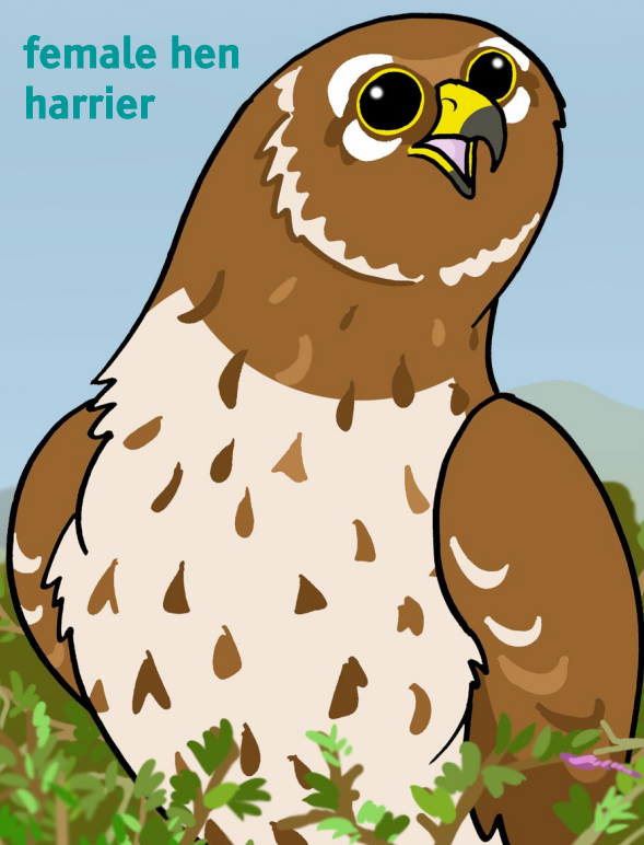
female hen harrier