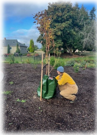
A Native Plantscapes NW employee removes a tree watering bag from the maple near the labyrinth on Sept. 18.