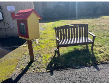
One of the benches we earned from plastic recycling is located next to the Little Library.

Thank you to everyone who has brought their plastic in. We were able to get two benches before the recycle place upped the pounds of plastic donation needed to earn a bench within 60 days or something like that.