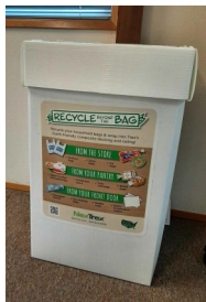
Drop off your plastic in this bin in the Parish Hall.