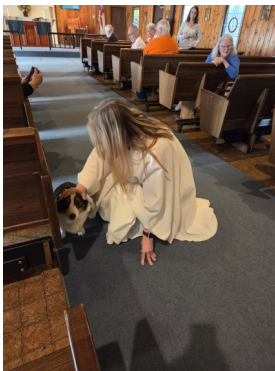
Poppy the Corgi