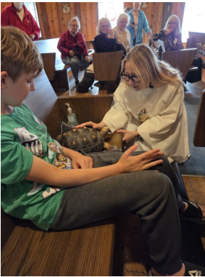
Mikey the Tortoise