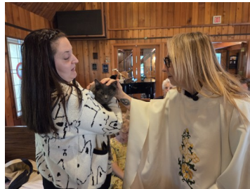
Alfredo the Kitten