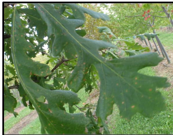
GREEN LEAF SUMMER

LEAVES are 7-15cm (3-6") long and 5-13cm (2-5") broad, variable in shape, with a lobed margin.