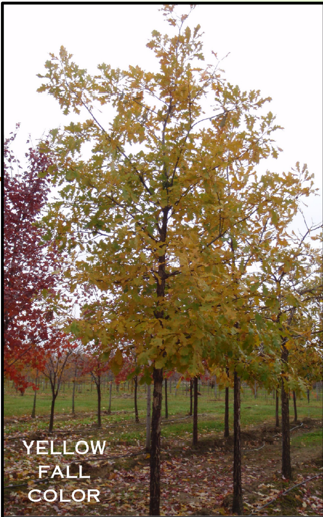
YELLOW FALL COLOR