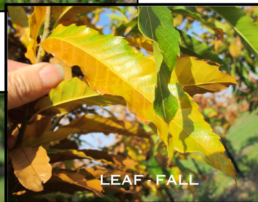
LEAF - FALL

LEAVES are 8-20cm long(2-4") and 3-6cm wide, with 14-20 saw like triangular lobes on each side, with the teeth of very regular shape dark glossy green and turn yellow in the fall. Winter leaves turn brown and hang on the tree until spring.