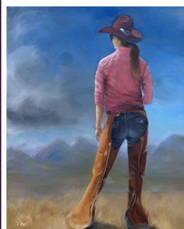
"Brass in Pocket"