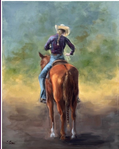
"The third braid"

Recently her piece "The Third Braid" was awarded second place in the fifth district as part of the "Best of Kern" That work will be included in this show.