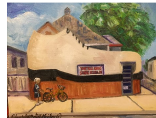
"The Big Shoe" by Charlotte White