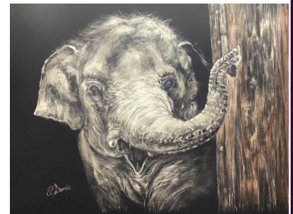
"Charise" by Edwina