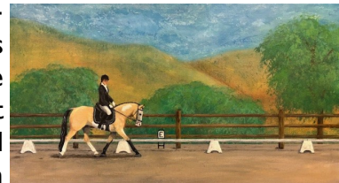
“Dressage Competition” by Lisa Faulkenberry. Portrays the elegance and quiet focus shared between horse and rider during a moment of performance