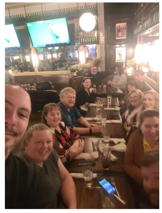
A night out on the town with MATA and friends!