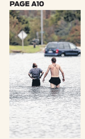
Newport, N.C., residents wade through high waters on Sunday.

North Carolina confronts a spiraling statewide crisis as Tropical Depression Florence slowly ravages the region, flooding cities, endangering communities and requiring well more than 1,000 rescues.