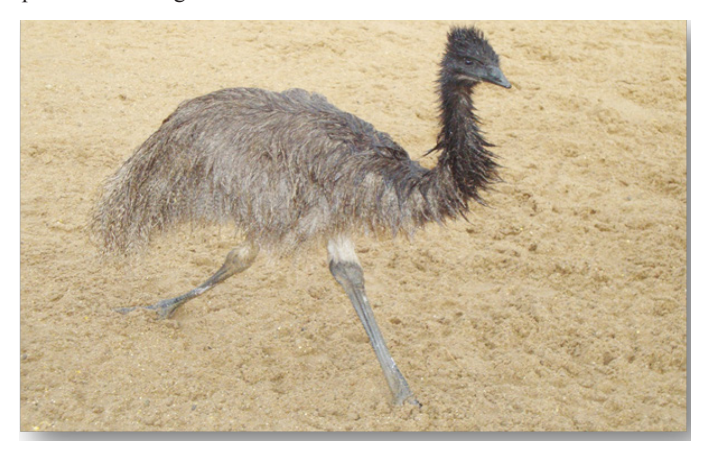
Figure I Leg deformities in emu bird (Dromaius novaehollandiae) observed in the present study.

This report investigated the role of low levels of serum calcium in development of leg deformities in emu birds. Serum was collected from the emu birds which were showing both leg deformities and estimated the calcium levels which revealed a significant reduction in calcium levels than do the apparently healthy birds. Birds were administered with oral calcium supplementation, but the morphology of leg deformities was not changed up to two months of observatory period except in two birds out of ten affected birds. The study suggests concluding that calcium alone is not responsible for development of leg deformities, but it is a multi-factorial problem in emu birds. Therefore, provision of balanced diet can play an important role in the prevention of leg deformities in emu birds.