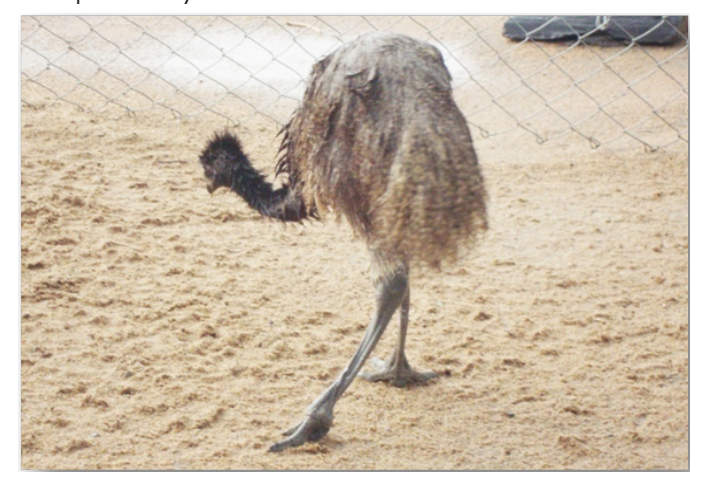
Figure 2 Leg deformities in another emu bird used for the present observation.

Emu farming in India is gaining commercial importance. Report on leg deformities due to hypocalcaemia was scanty for emu birds. Hence, this communication reports investigated effect of calcium