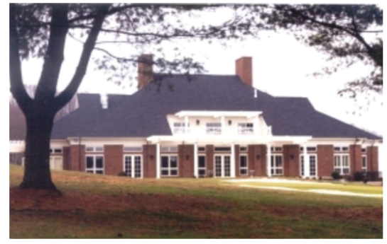
Glenrochie Country Club 200 Clubhouse Drive | Abingdon, VA

On May 09th, Kiwanis will host a golf tournament at the Glenrochie Country Club to raise money in support of our local children and youth programs programs such as the Washington County Library's Summer Reading Program.