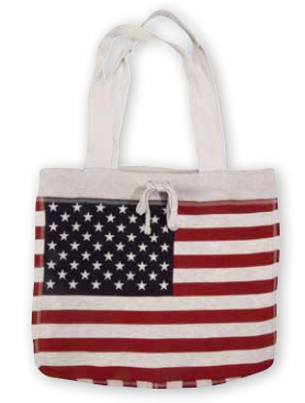
AME American Flag