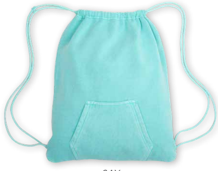
6AY Barbados Blue