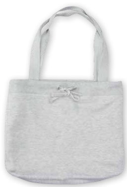
257 Marble Heather