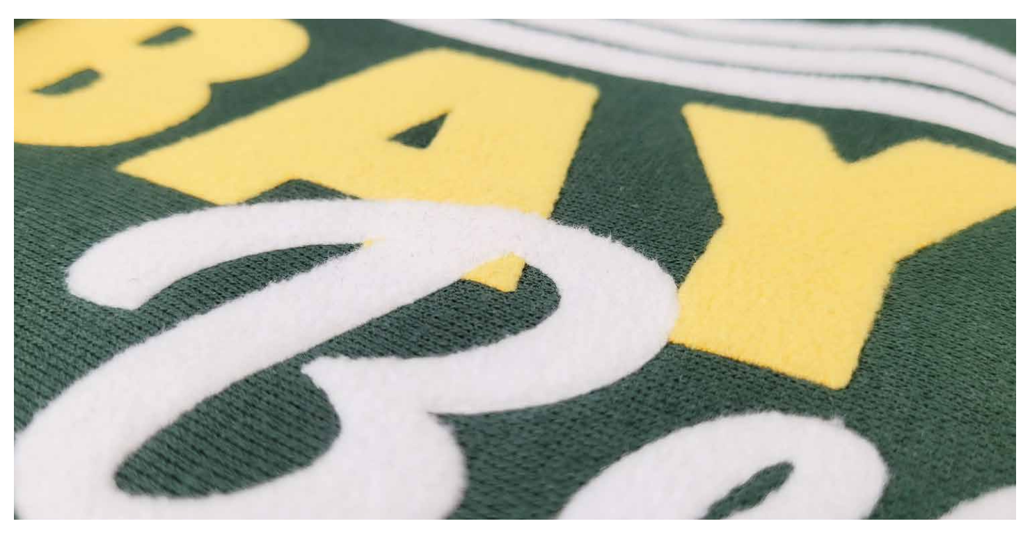
Flock Print Soft & Velvety Hand Feel. Retro 1970's Vibe. Colorfast & Machine Washable.