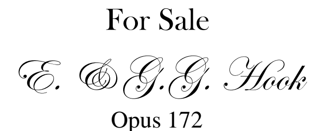
pus 17 1854