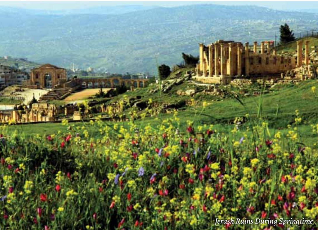
Jerash Ruins During Springtime