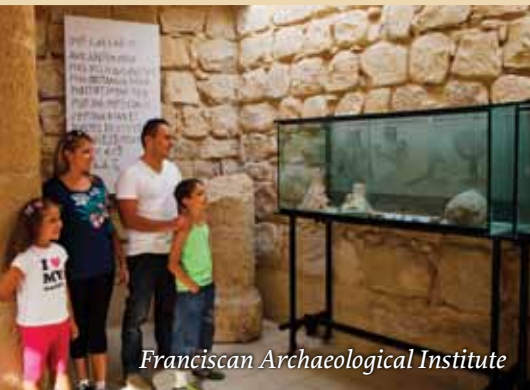
Franciscan Archaeological Institute

One of the things in abundance in Jordan, besides hospitality and great food, is the amount of significant biblical sites. Mukawir is a great example of that as it was the location of events that greatly affected religious history. Situated about an hour away from Madaba on the picturesque King's Highway, Mukawir once served as the hilltop stronghold of Herod the Great and later was the location where Herod Antipas ordered the beheading of John the Baptist after Salome's fateful dance of the seven veils.