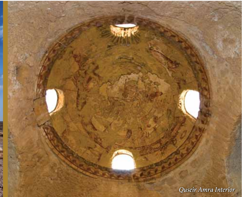
Quseir Amra Interior