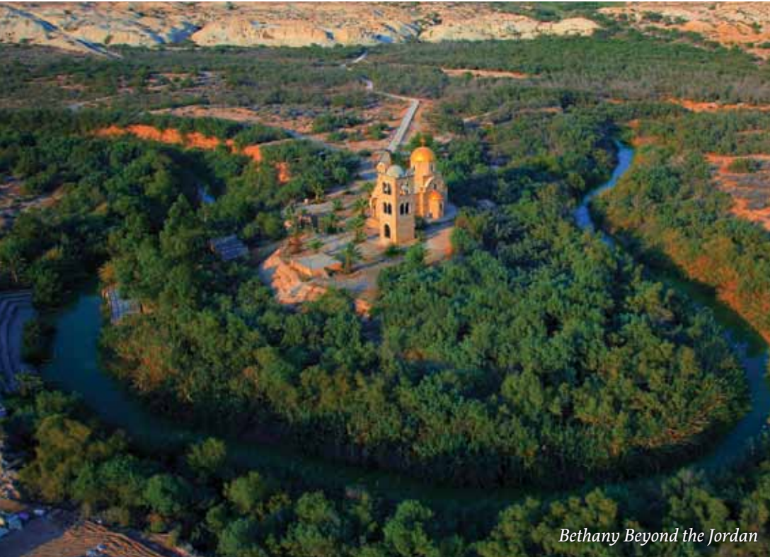
Bethany Beyond the Jordan