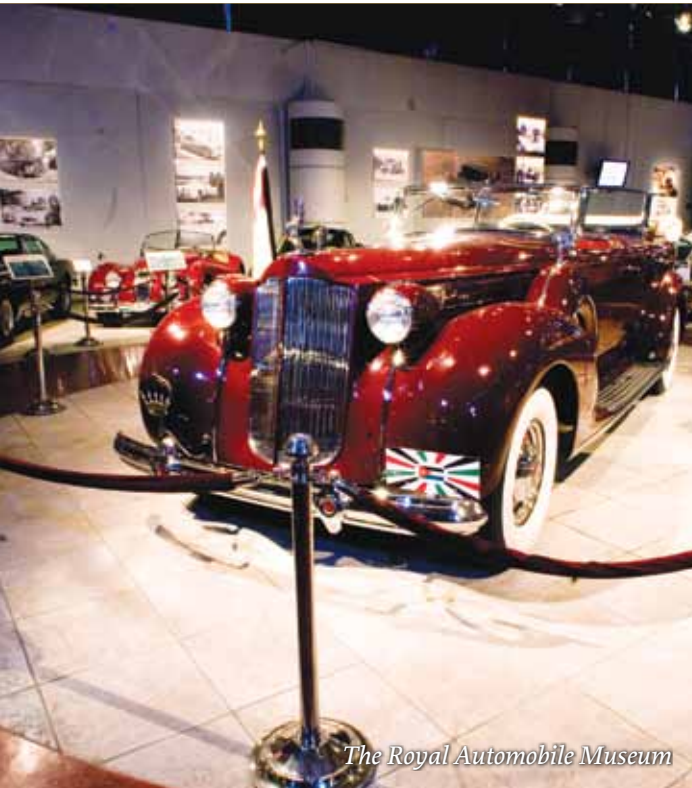
The Royal Automobile Museum