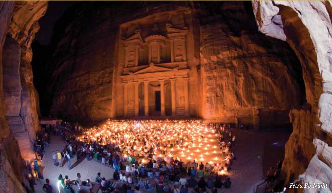
Petra By Night