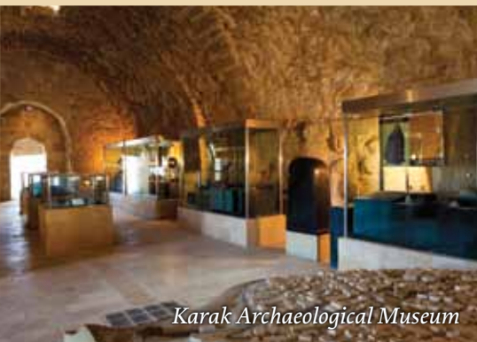
Karak Archaeological Museum