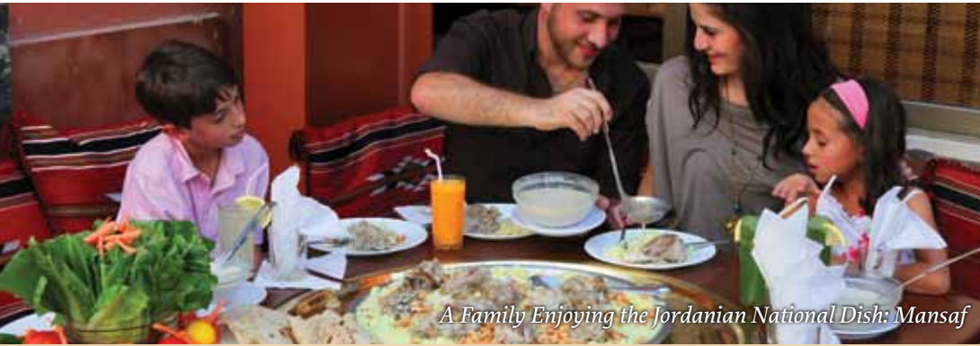
A Family Enjoying the Jordanian National Dish: Mansaf