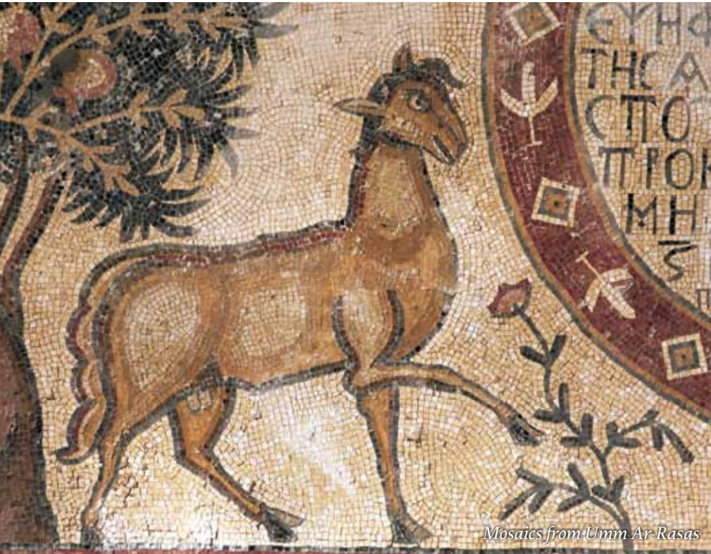
Mosaics from Umm Ar-Rasas