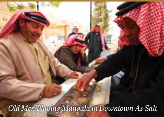
Old Men Playing Mangala in Downtown As-Salt