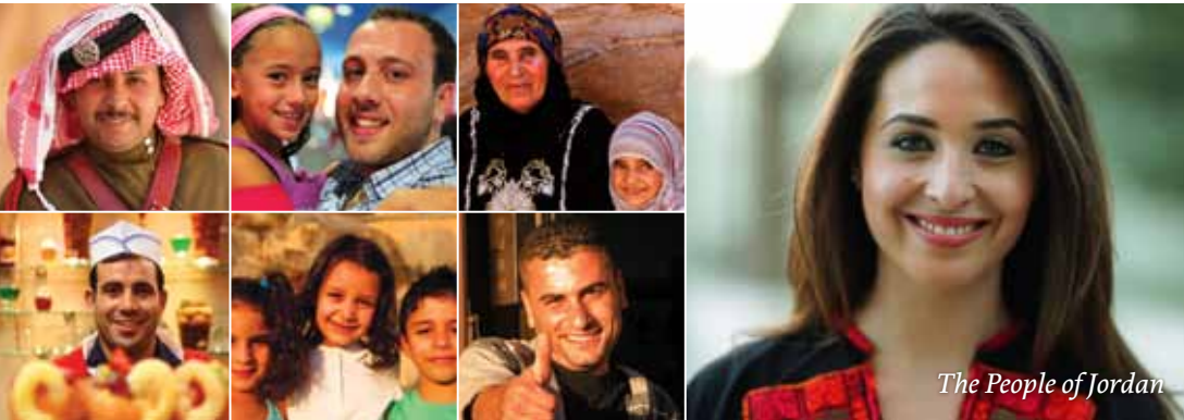
The People of Jordan