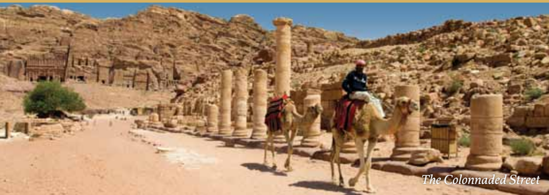
The Colonnaded Street

Trade caravans laden would break at Petra, which offered a plentiful supply of water and protection from marauders. In return for their hospitality, the Nabataeans imposed a tax on all goods that passed through the city and grew wealthy from the proceeds. Petra later flourished under Roman rule, and many Roman-style amendments were made to the city, including the enlargement of the theatre, paving of the colonnaded street, and a triumphal arch was built over the entrance to the Siq. When the Roman Emperor, Hadrian, visited the site in 131 AD, he named it after himself, Hadrian Petra.