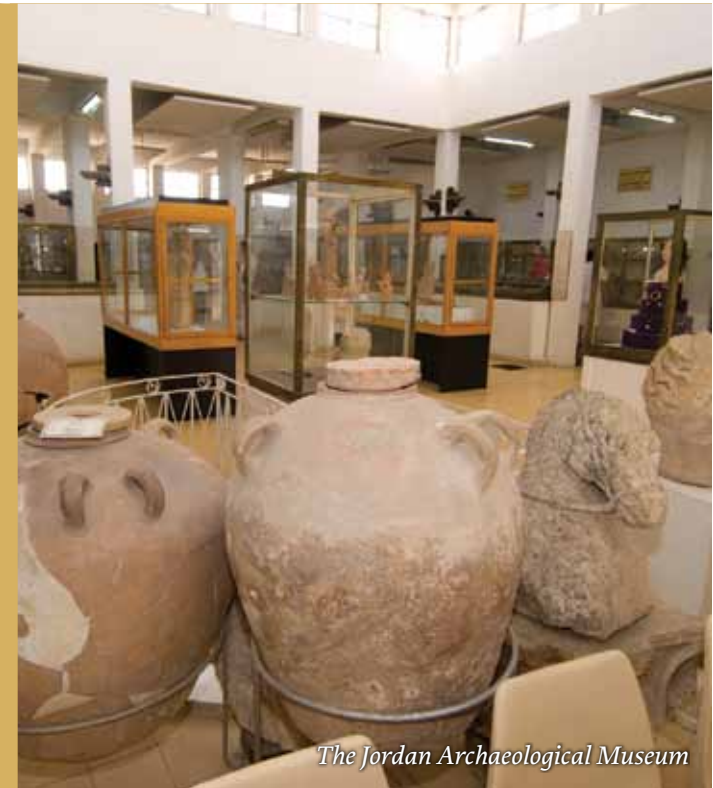
The Jordan Archaeological Museum