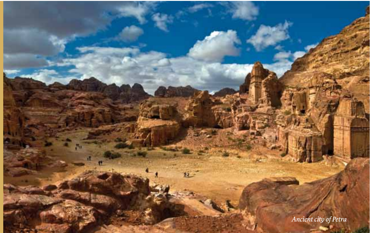
Ancient city of Petra

For more itineraries, please check our website www.VisitJordan.com