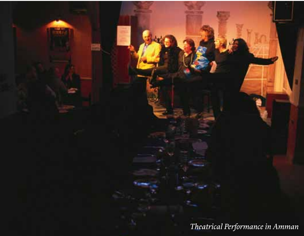
Theatrical Performance in Amman