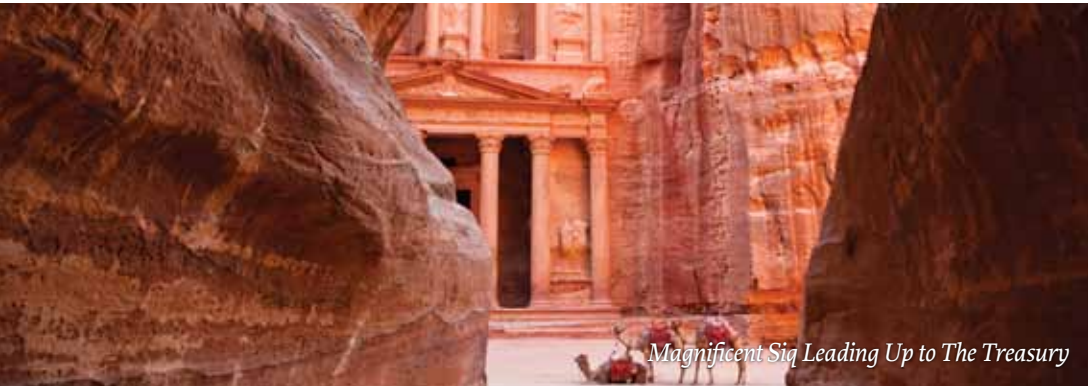
Magnificent Siq Leading Up to The Treasury