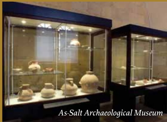
As-Salt Archaeological Museum