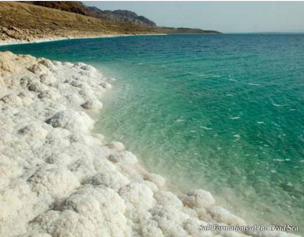
Salt Formations at the Dead Sea