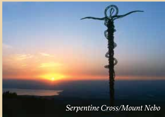
Serpentine Cross/Mount Nebo