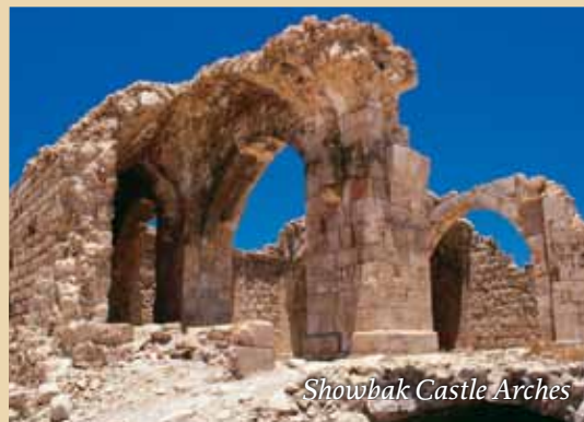
Showbak Castle Arches