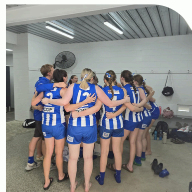
Sisters get the win!