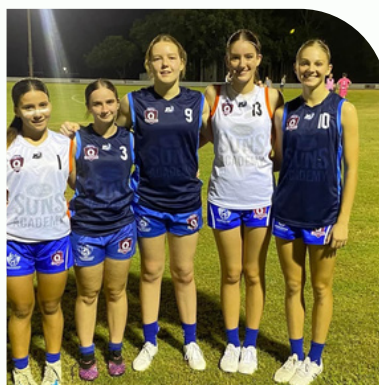
U16 Roo Girls reppin' it!