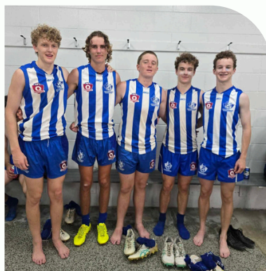
U17s playing up & gettin' it done!