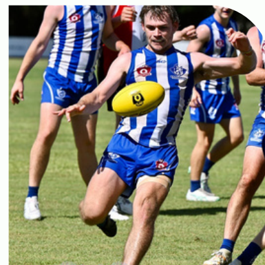
Senior Men battled it out