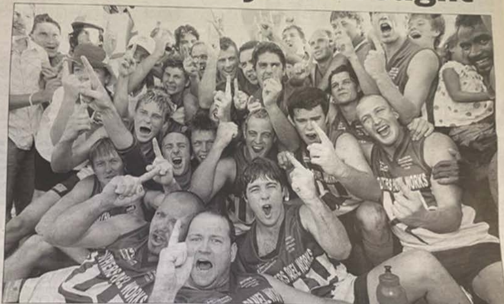
CELEBRATION TIME: With the hard work all over, Brothers A-grade players celebrate their first premiership flag in 10 years after a dominant display against the Glenmore Bulls at Stenlake Park.

Glenmore were on the back foot from the start, with the damage done in the opening quarter as