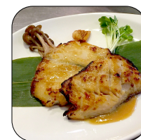
BLACK COD MISOYAKI