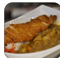
CURRY DON WITH PORK KATSU