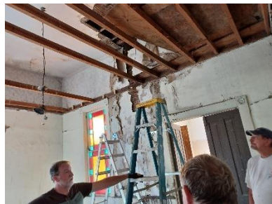
Jerry Lively, Dick McPherson (in foreground) and Joe Jones take a break to discuss how to safely remove overhead decking & framing

A strong turnout for the workday on Saturday, July 23 rd , accomplished more than just staining of the porch structure. Interior work included