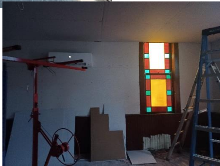
Future Caterer’s Kitchen

welcome! Please let us know what you’re interested in doing, and when you’d like to do it. It all helps us get past the goal line.