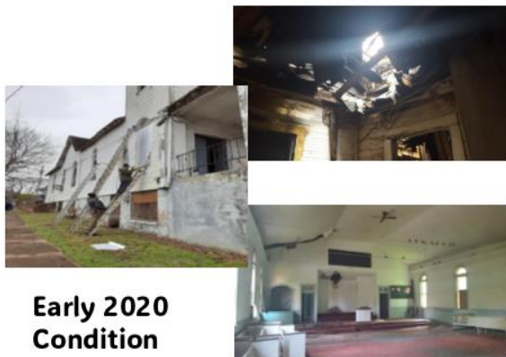
Early 2020 Condition

Regarding progress on Harriman Hall, a photo summary since obtaining the structure the end of 2019 reflected the significant progress of stabilizing the structure and beginning to finish the interior.