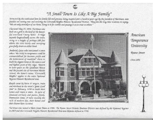
Inside flap of 1999 Christmas Tour recognizes "A Small Town Is Like A Big Family"

This set the scene for development within the Harriman city limits along Hwy 70, including bringing in a Lowes Home Center and the relocation of Kroger to a much larger footprint for its grocery store, pharmacy and more. Soon after Covenant Health obtained control of the Roane Medical Center, it was also announced that the current hospital located in downtown Harriman was to be replaced by a new medical plaza South of the Pinnacle Point Plaza.