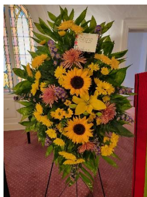
Hall workdays in 2022.