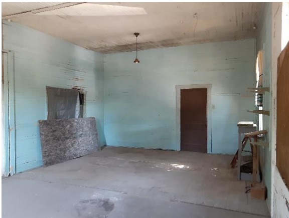
Space for Restrooms Looking North

CHHCO continues to be blessed by generous people with their time and money, but we're using contractors for certain items. Therefore, funds are diminished quickly and may stop progress at times without continuing funds. Those that pledged across a 5 year span have fulfilled their pledges, and new donors are