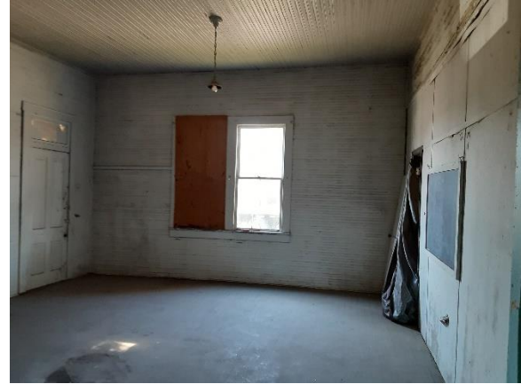
Looking South Towards Office

needed! Please continue to support the renovation of Harriman Hall through your physical and financial support. We're not done. All donations go directly to the renovation of Harriman Hall, and are not used for any of the organization's operating expenses.